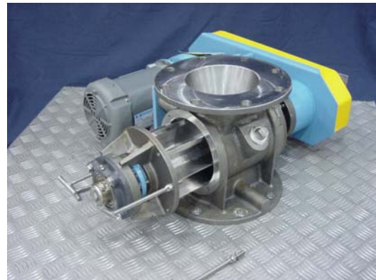
Rotor Pulled Free