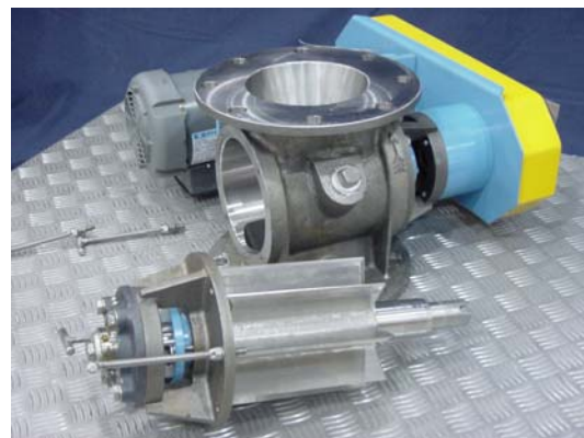
Rotor and End Cover Loose